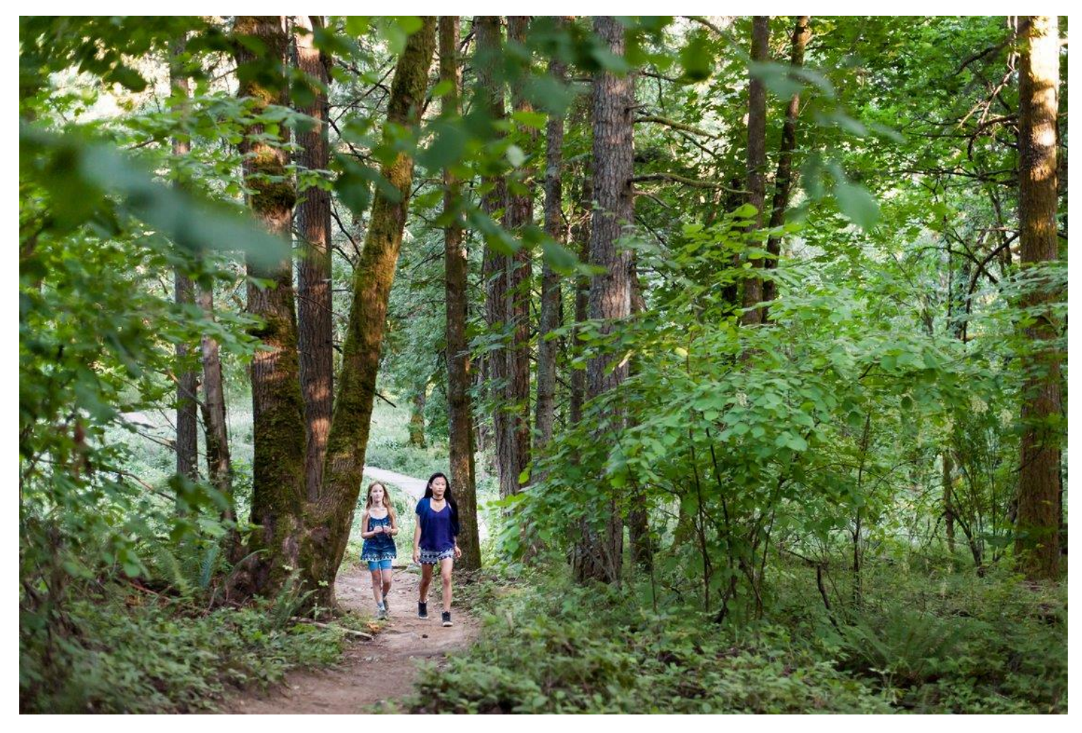
Photo (above): Two hikers enjoying Mt. Talbert Nature Park.